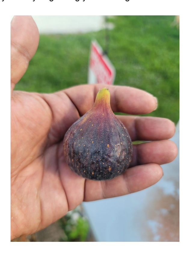
Chapter 3: Rooting Fig Cuttings

In summary, choosing the right fig cuttings is critical for successful propagation. Look for healthy, disease-free branches that are the right size and type for the season. Use clean, sterilized tools and prepare your cuttings carefully, using a rooting hormone if desired. Remember to keep your rooting cuttings away from direct sunlight. With the right tools and techniques, you'll be on your way to growing your own fig trees from cuttings.