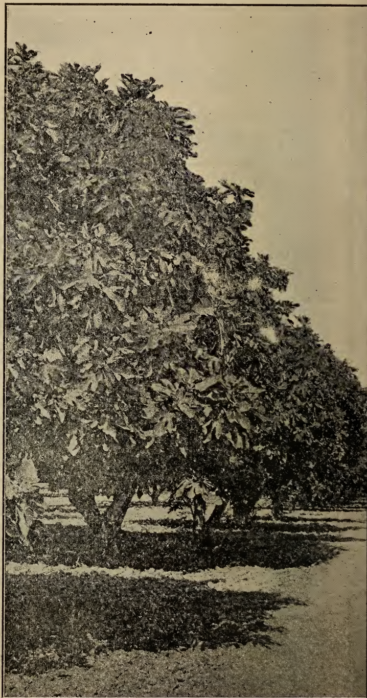
One of the Wonder Fig Gardens